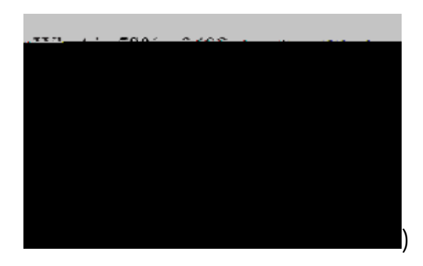
&93)A2B67)89A. 9?.)B. 7)76.)3+9?B), ?83.+=)